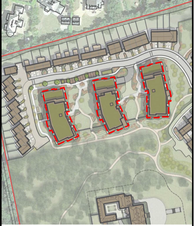
KEY PLAN INDICATING POSITION OF APARTMENTS BLOCK 1, 2, & 3 NOT TO SCALE